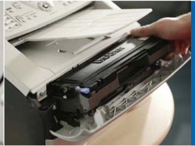
Separate toner and drum