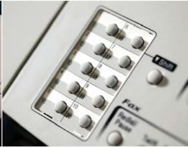
20 One-touch dial locations